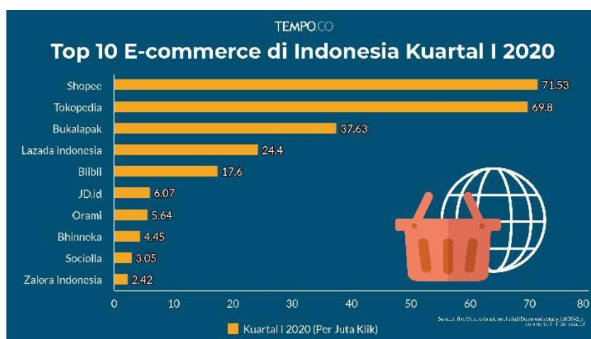
Figure 1. Top 10 E-Commers Users in 2020

Taufik & Ayuningtyas (2020) added that some business fields may experience obstacles in its development and even a decline during the COVID-19 pandemic if it persists on direct visits from consumers (Zebua & Sunaryanto, 2021).