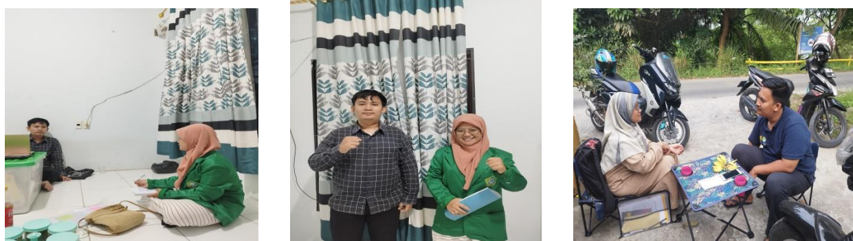
Figure 1. Interview process