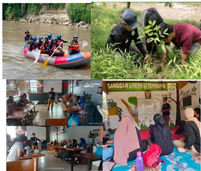
Figure 3. Yayasan Gerakan Peduli Sungai Programme